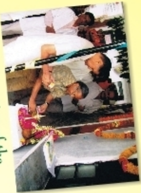
Inauguration of the new dispensary room