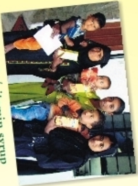
Protein/vitamin syrup for the little ones