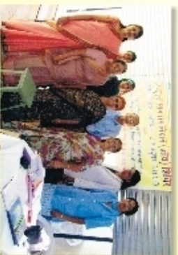
Breast cancer detection camp volunteers