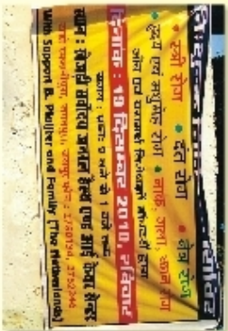
Banner of the major health camp