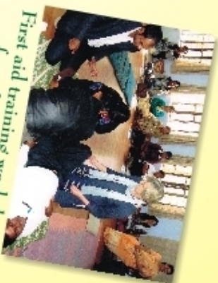
First aid training workshop for school teachers