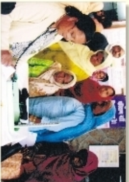
Busy intake at the health camp