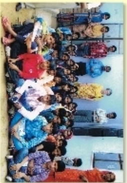
Health education class prize distribution at Ideal Public School